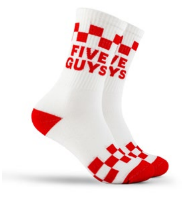
Five Guys Checkered Sport Socks £10.00