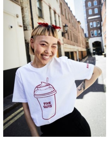
MAKI Crew Member at Five Guys Coventry. Joined March 2022.