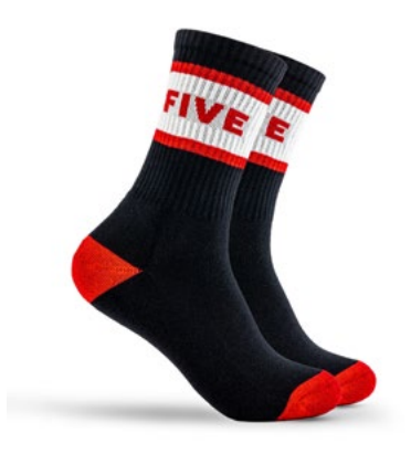
Five Guys Colourblock Sport Socks £10.00