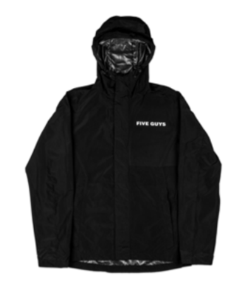
Five Guys Logo Lightweight Rain Jacket with Hood £50.00