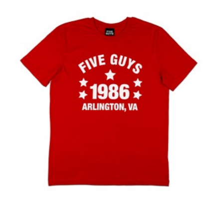
Five Guys Arlington 1986 T-Shirt £20.00