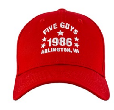
Five Guys Arlington 1986 New Era Baseball Cap £25.00