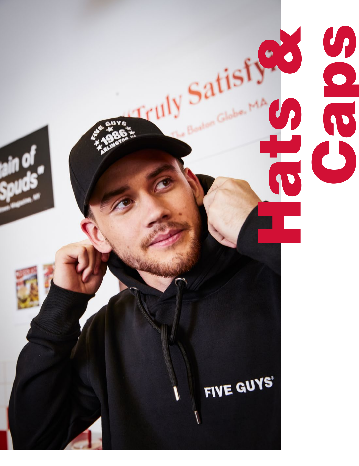
ARLINGTON 1986 NEW ERA BASEBALL CAP

A Five Guys branded Official New Era 9FORTY Cap to complete your streetwear look. Available in black & red.