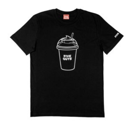
Five Guys Milkshake Icon T-Shirt £20.00