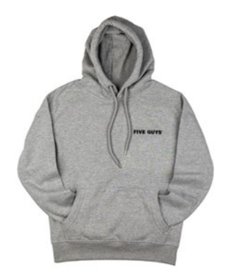
Five Guys Organic Cotton Hoodie £45.00