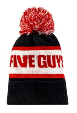
Five Guys Pom Beanie £15.00