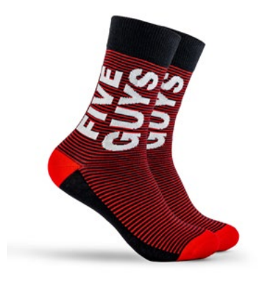
Five Guys Striped Dress Socks £10.00