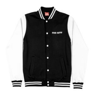
Five Guys Arlington 1986 College Varsity Jacket £75.00