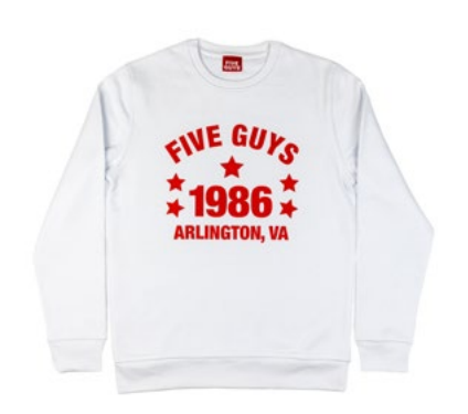
Five Guys Arlington 1986 Sweatshirt £35.00